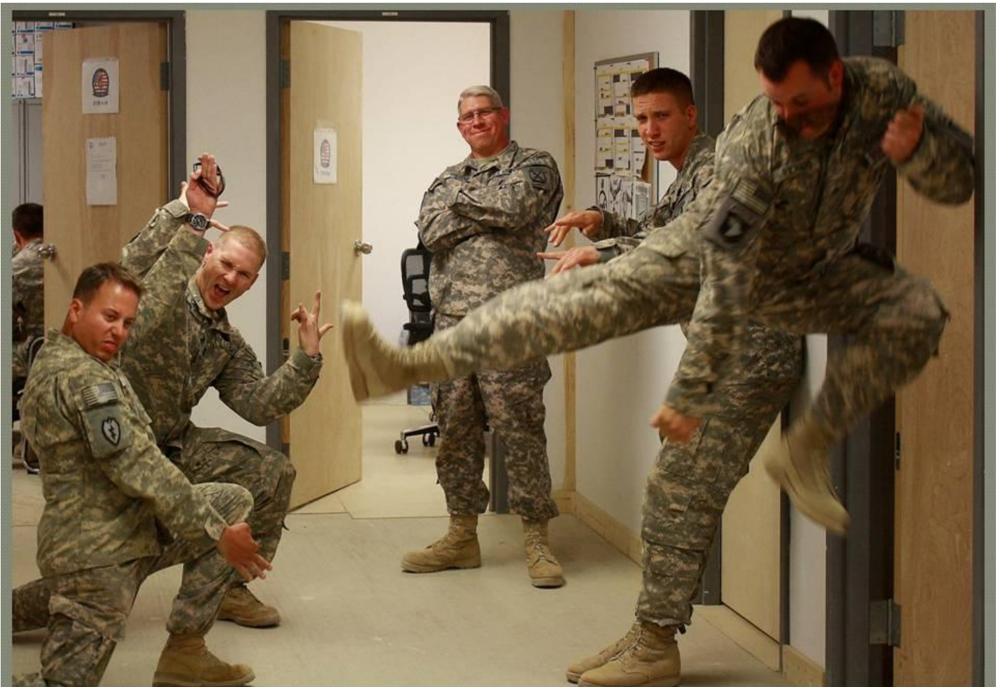
DAY JOBS: Don't quit them boys.....don't quit them.